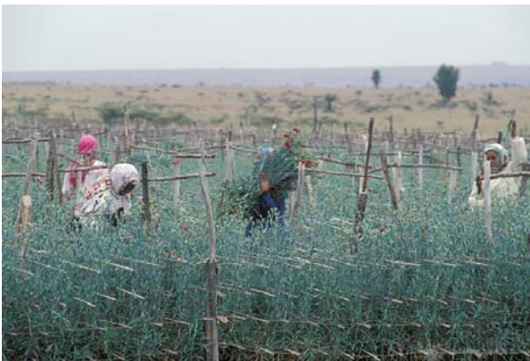
Flower farm. Kenya.