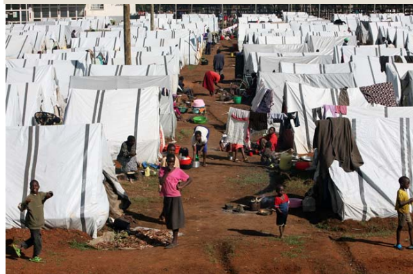
A view of the Eldorado Internally Displaced Persons Camp, April 2008. The camp hosted over 14,000 people displaced during the post-election violence in Kenya.