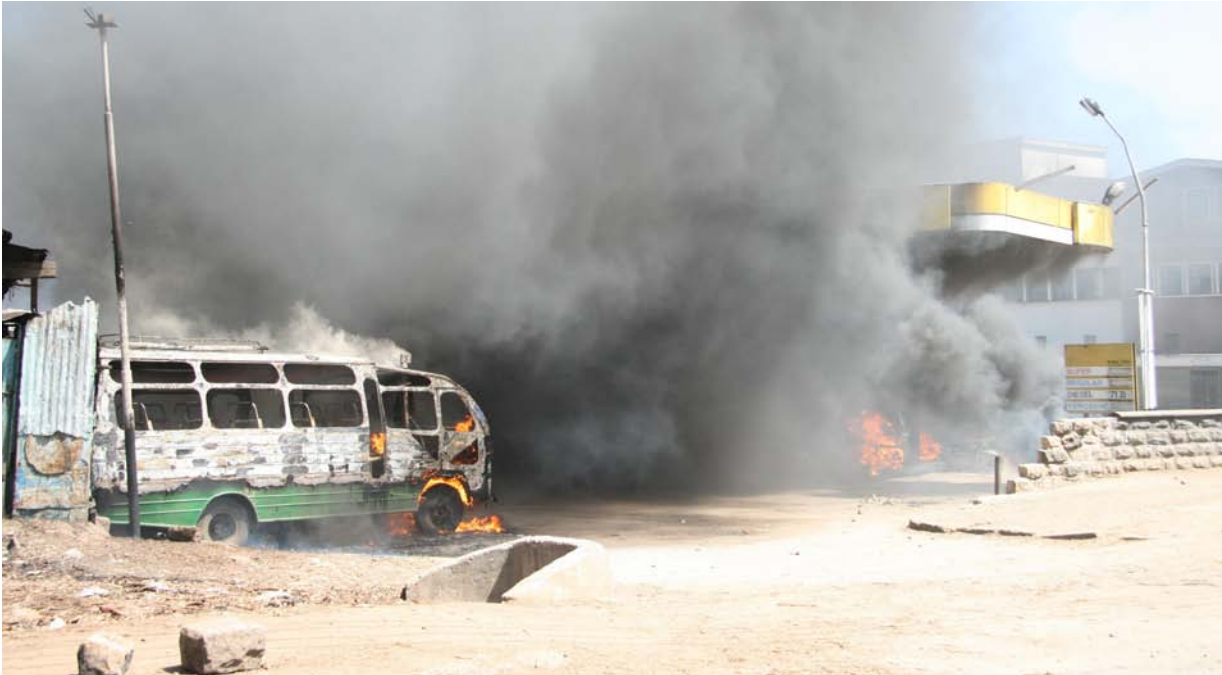
A petrol station and a vehicle set alight by protesters against the Kenyan government. Mathare slums, Nairobi. January 2008.